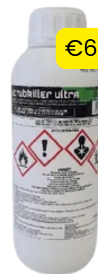
SCRUBKILLER ULTRA 1LTR