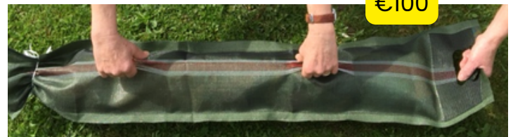
Silage Bags 50 pack