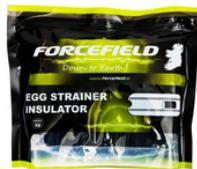
Egg insulators 10pck