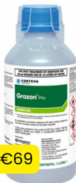
GRAZON PRO 1LTR