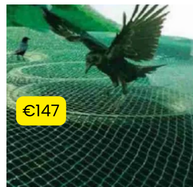
Rhino Bird NET 15 x 20m